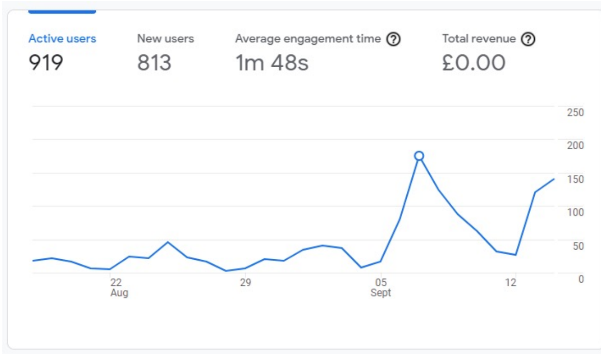
Above: Website users – last 28 days (18.08.21-14.09.21)